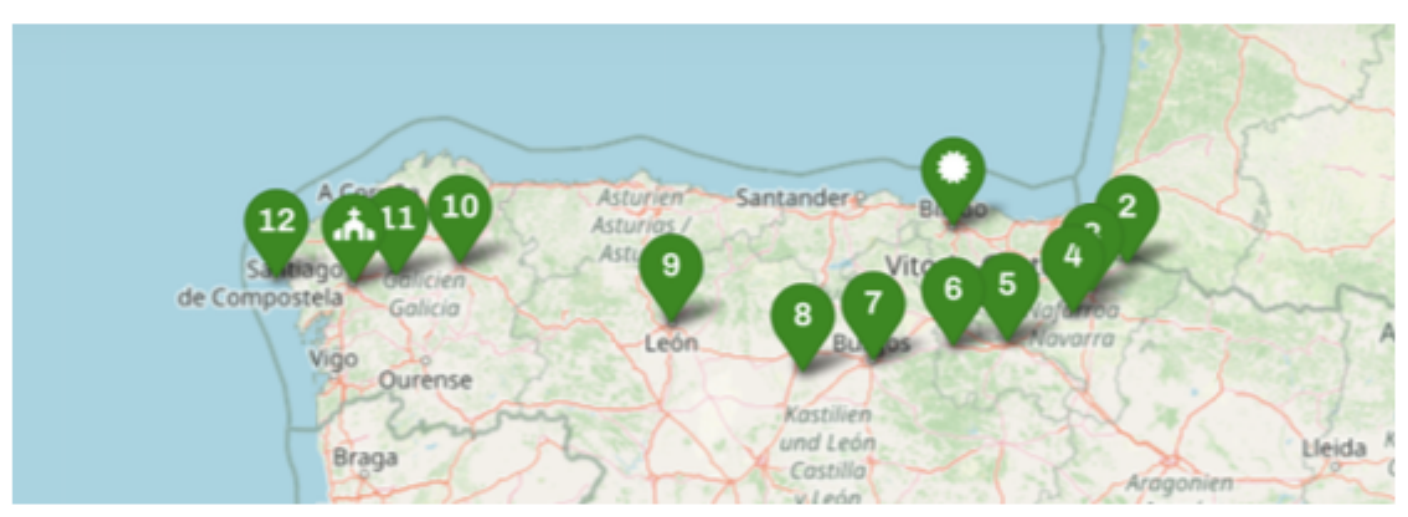
The Camino de Santiago, from Saint-Jean-Pied-de-Port to Finisterre.